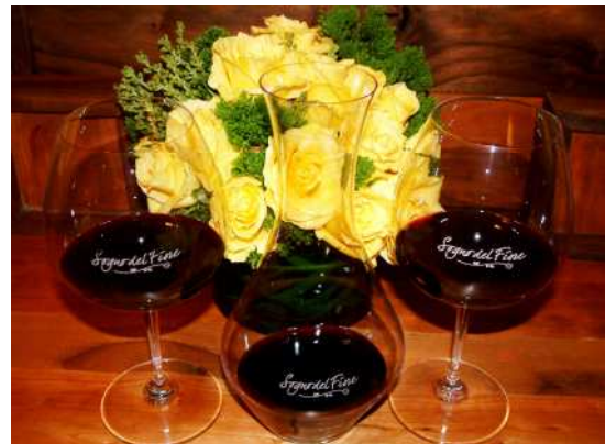
“Let it breathe”

Tasting notes and technical information have been provided by the winemakers for each winery. See bottle tags for tasting notes.